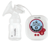
BC 200 Comfy