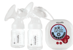
BC 300 Maxi 2 in 1